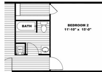
OPTION 2 BEDROOM